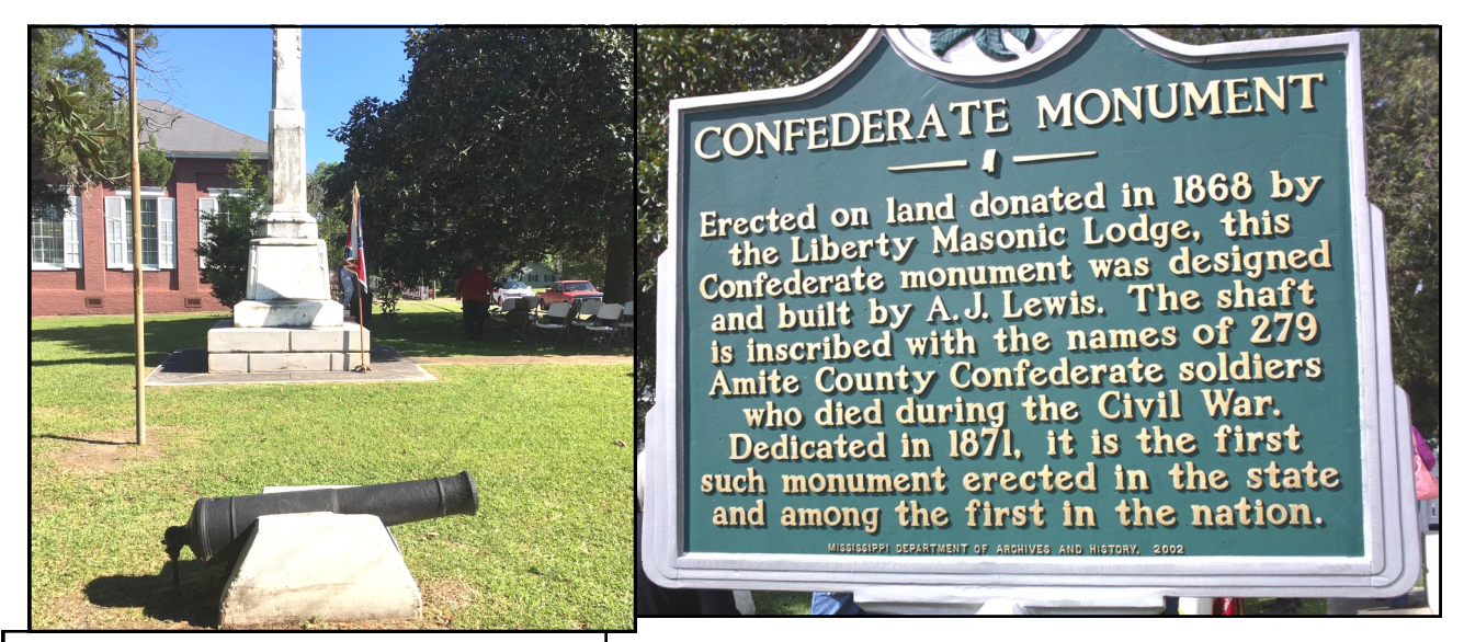
Confederate Monument (looking north)

Since I haven't received any write-ups or suggestions for column material lately, I thought I'd share photos from the flag ceremony held at the last meeting that were posted to the society's Facebook group page. For those that receive the newsletter by mail, I'll try to reproduce the images as clearly as possible but they won't be in color. Photo credit key: WGB means Greg Barron; NR means Neil Randall; no credit means this editor.