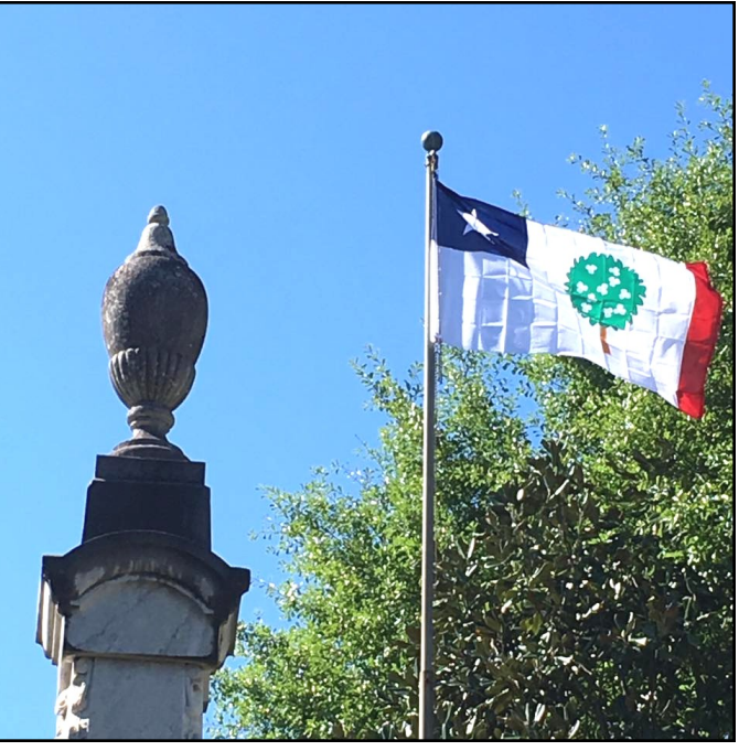
Above: The Magnolia Tree Flag flying next to the monument.

Left: The UDC Ladies and Allen Terrell